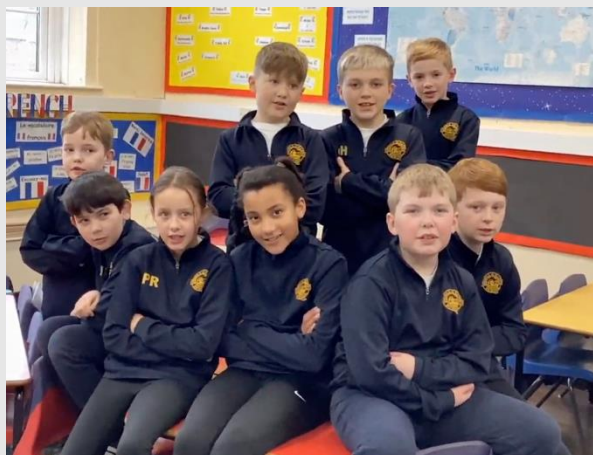
Spiritual, Cultural and Moral Education

Year 5 pupils enjoyed showing each other their TikTok videos advertising the Bowling Club in Pelaw. Big thanks to Pride Radio for supporting this project.