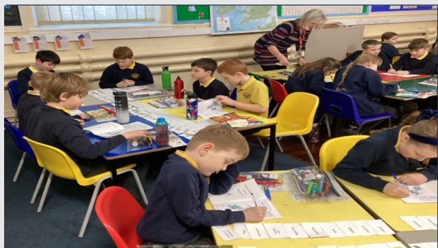
British Values and Enterprise Education

Our Year 6 pupils spent this term learning about Lego Robotics. Their hard work culminated in them taking part in a Lego Robotics tournament at Nissan.