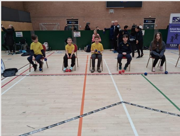
Physical and Active Lifestyles

We were delighted to welcome parents and carers into school to see first-hand all of the fabulous opportunities for play children now have at lunch time, including our fantastic new garden zone.