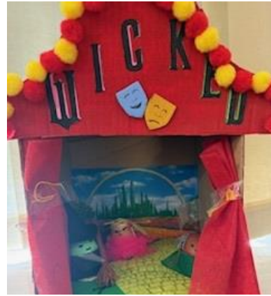
Year 5 - Amber & Ayda