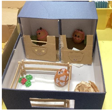
Year 4 - Darcy