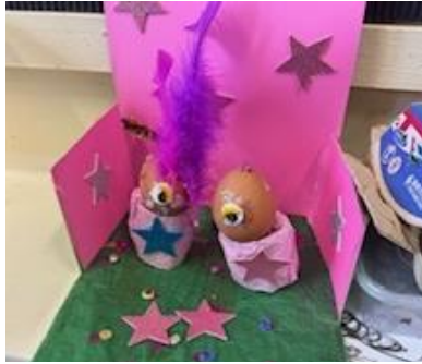
Reception - Hallie